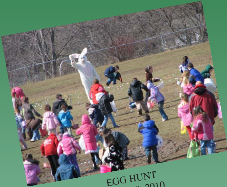
EGG HUNT March 20, 2010