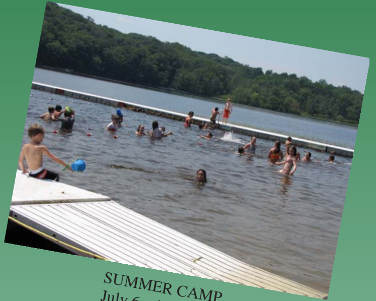
SUMMER CAMP July 6 - August 13